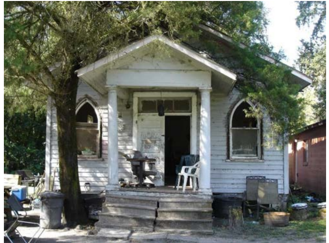
Photo: From Left to Right: 1916 Seventh Day Adventist Church “The Church Beautiful”. The church today.

FOR IMMEDIATE RELEASE – SEPTEMBER 11, 2020